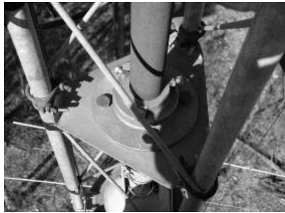
Figure 2 Detail view of lower thrust bearing mounted on standard rotor shelf. Note the Z-braces were cut to allow shelf to be mounted at this spot in the tower section