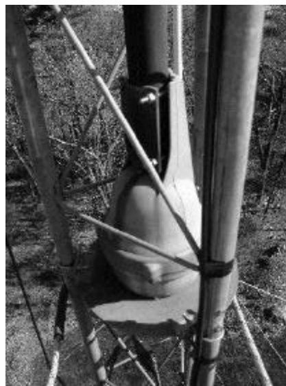
Figure 4 Detail view of rotor mounted on custom rotor plate.