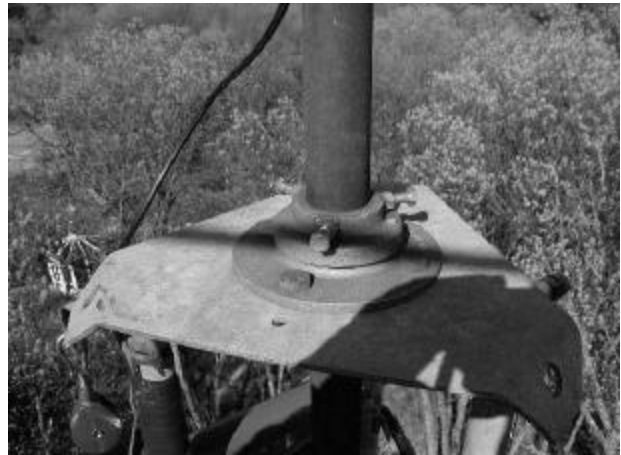
Figure 3 Detail view of thrust bearing mounted on top of tower top section.