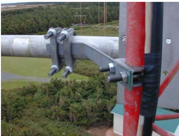
Director Side Bracketing

Now at the boom, you take one piece of the steel and affix one end to the tower leg using the small muffler clamp and saddle be sure to affix the steel so that it is level and parallel to the boom. The other end of the steel is then rotated on the tower leg until the 4" flat piece hits the boom flush (meaning the 4" segment is now parallel to the boom and resting against the side of the boom.. Hopefully you will not have an ELEMENT mounted just there - so plan ahead on this stuff!