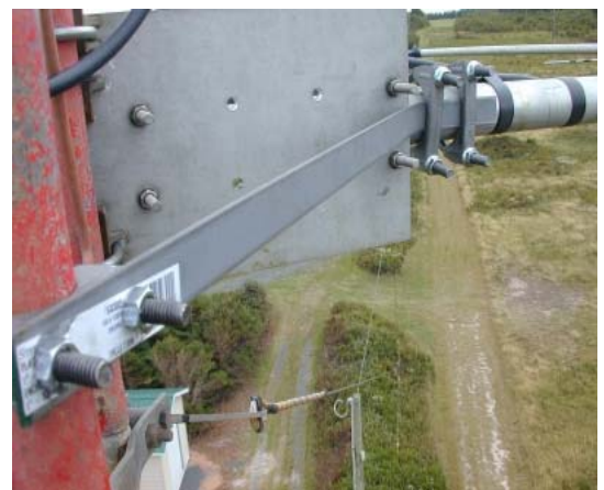
Reflector Side Bracketing

When done this way, the boom to mast mount is not relying on a single tower leg for yagi support and the tower is completely safe from torquing - plus all three legs are taking the brunt of the weight & twist caused by the antenna - and not a single leg.