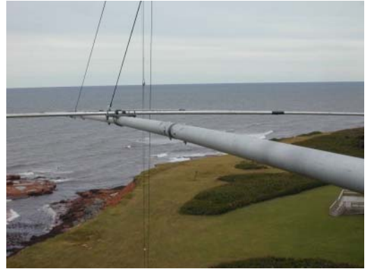
6EL OWA at 60° - Director End

At one end of the steel I drill two holes to accept the U bolt from a small muffler clamp - I am pretty sure I am using either a 1.25 or 1.125 size. You want something that will fit snugly around the tower leg with its own saddle. The rest is very simple - at the OTHER end of the steel, you make about a 30 degree bend down 4" from the end of the piece - you can do this by putting the end under a board, standing on the board and then lifting the steel up to make the 30 degree bend.