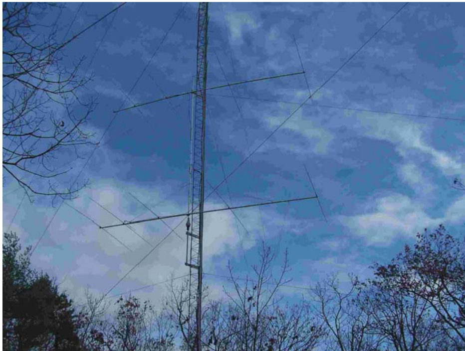
The South America Antenna

Here is the South America antenna. I stuck it on a rotator so that it has limited rotation from about 150 to 300 degrees. It also works great to the USA and VK as a result. None of the guy wires have insulators, (It is my 222 MHz tower) so there is some interaction, as my VHF towers are close together and at last count I had eight towers with guy wires all over the place. but I see big improvements over a single yagi in most of the directions it will cover.