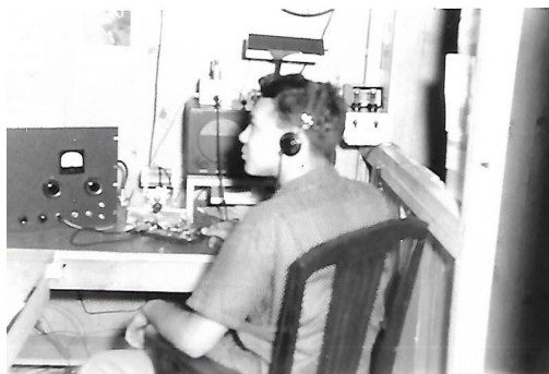
HB TX using pr 6146's with HB VFO, S40 RX (Answer on page 7)