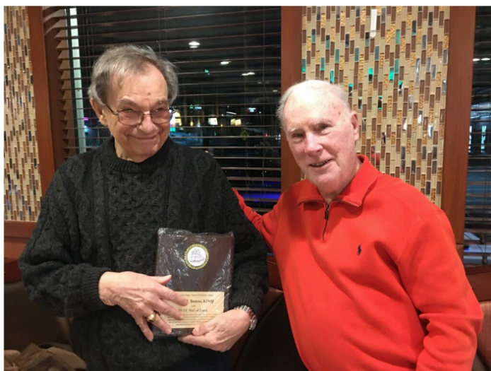
L to R, K2KQ, KF2O