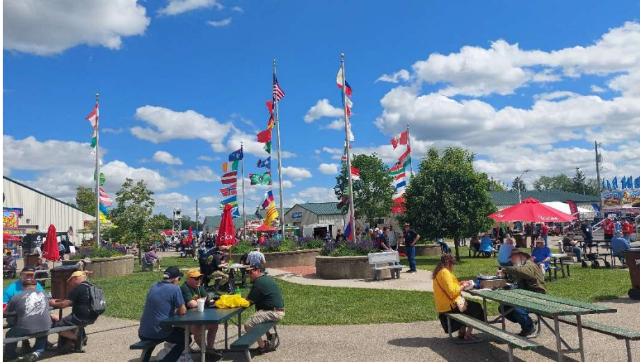
Hamvention Fairgrounds early Friday

through the vendor exhibits and about 2/3rds of the Flea market. Towards the end of the day the State and local police were encouraging the Flea market folks to break down their shelters/pop-ups as they were expecting an intense weather front to move through.