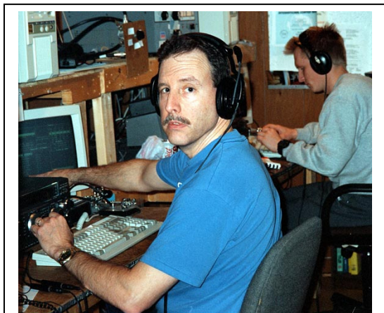
Figure 3 WO1N at the K1TTT 80M station during the 1997 CQWWCW