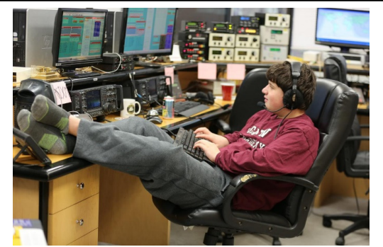
Figure 2 NN1C Tearing up the bands