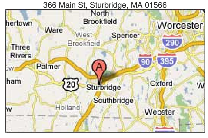
Sturbridge Host Hotel & Conference Center is located on Route 20.