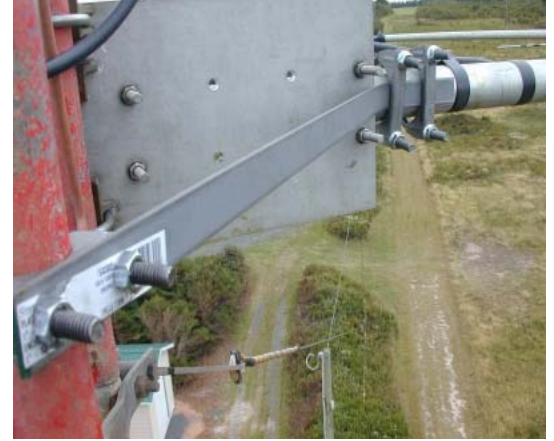
Reflector Side Bracketing

When done this way, the boom to mast mount is not relying on a single tower leg for yagi support and the tower is completely safe from torquing plus all three legs are taking the brunt of the weight & twist caused by the antenna - and not a single leg.