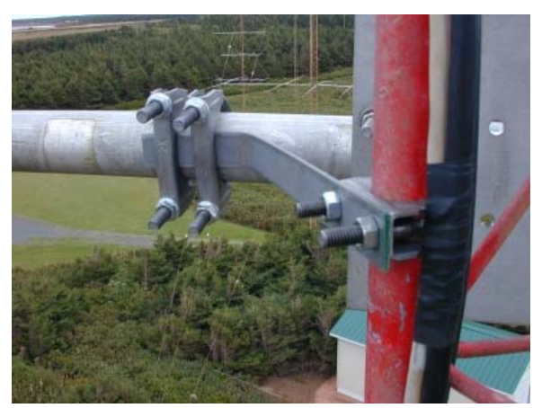
Director Side Bracketing

At one end of the steel I drill two holes to accept the U bolt from a small muffler clamp - I am pretty sure I am using either a 1.25 or 1.125 size. You want something that will fit snugly around the tower leg with its own saddle. The rest is very simple - at the OTHER end of the steel, you make about a 30 degree bend down 4" from the end of the piece - you can do this by putting the end under a board, standing on the board and then lifting the steel up to make the 30 degree bend.