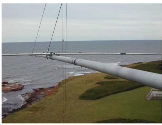
6EL OWA at 60' - Director End

The steel is 1/8" thick and measures 1 or 1.25" wide and I think it is either 18" or 24" long. I think what I used was probably it 18" come to think of it. It could be as short as 14" but I think it is 18" - but no matter as this is not rocket science.