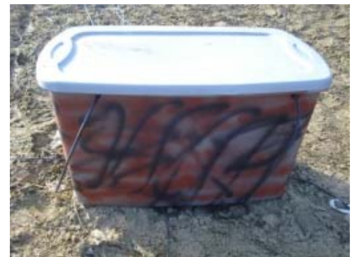
Nothing like Camouflage to hide the working parts