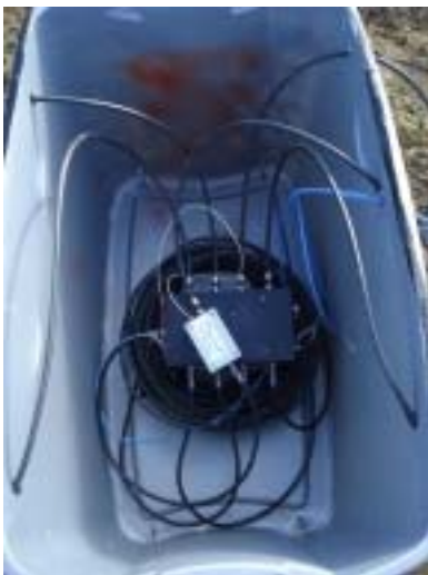
Here's what makes it work!