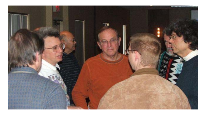
W3SM K1XM W1WEF K1HI K1NQ K2TE W1JQ