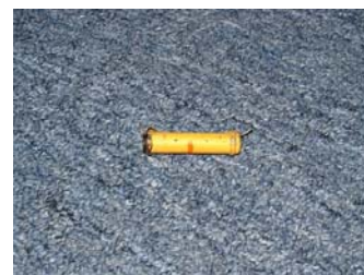
40,000 ohm, 2Watt, circa 1935

I recently ran across some old radio history when cleaning out a corner of my cellar. The photo shows an antique resistor. The color code was read in the order "Body, end, dot", so the 2 watt resistor shown is 40K ohms. I know that some of you have never seen a resistor like this...heck, my grandkids never saw a dial telephone!