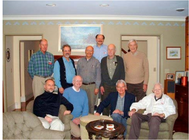
Rear: K1NA, W1RM, W1WEF, N1DG, W1AX, N4XR Front K3NA, K1ZZ, W1JR, W1BIH