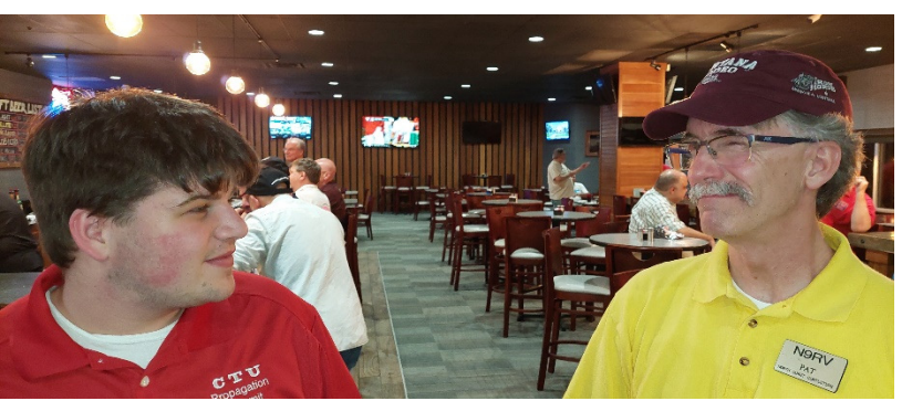
N9RV and NN1C no doubt planning the next mega-station build

After the full day of Contest U, I found myself lacking in plans. At that point I bumped into K9PG who was