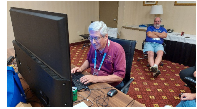
K1VR Operating E51D while N1HTS looks on

The YCCC track got a bit messed up when one contributor had to cancel. I then got put in the penalty box as I was not able to find a replacement talk quick enough. For the